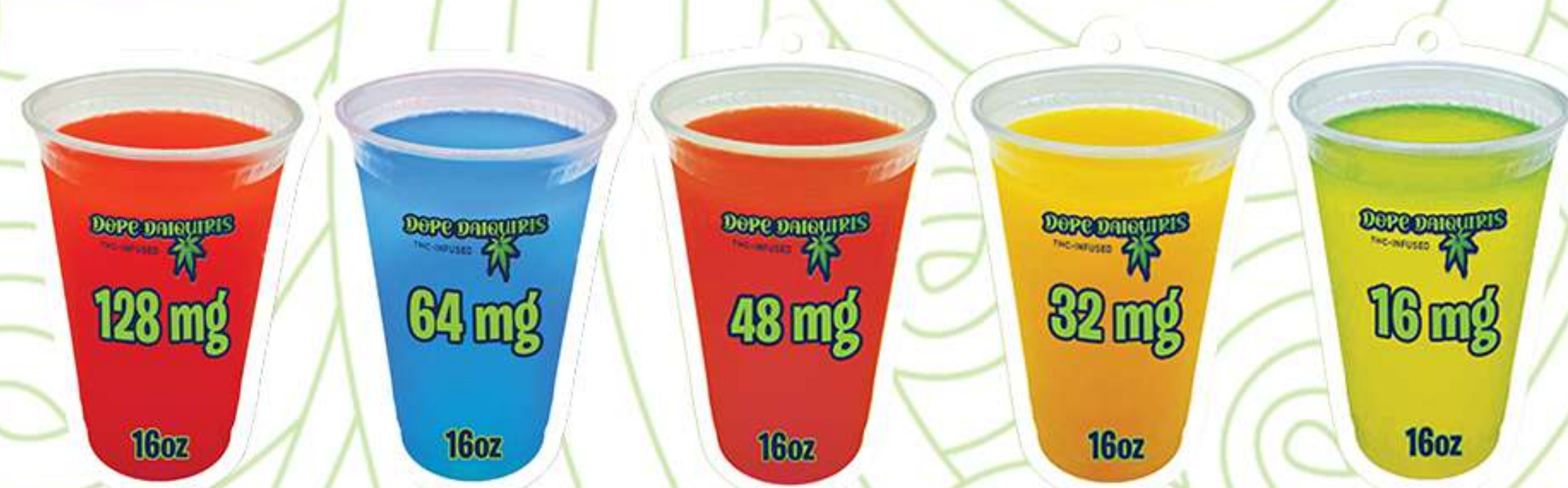
Machine Potency Signs