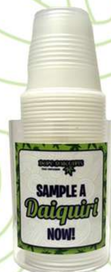
Sample Cup Dispenser