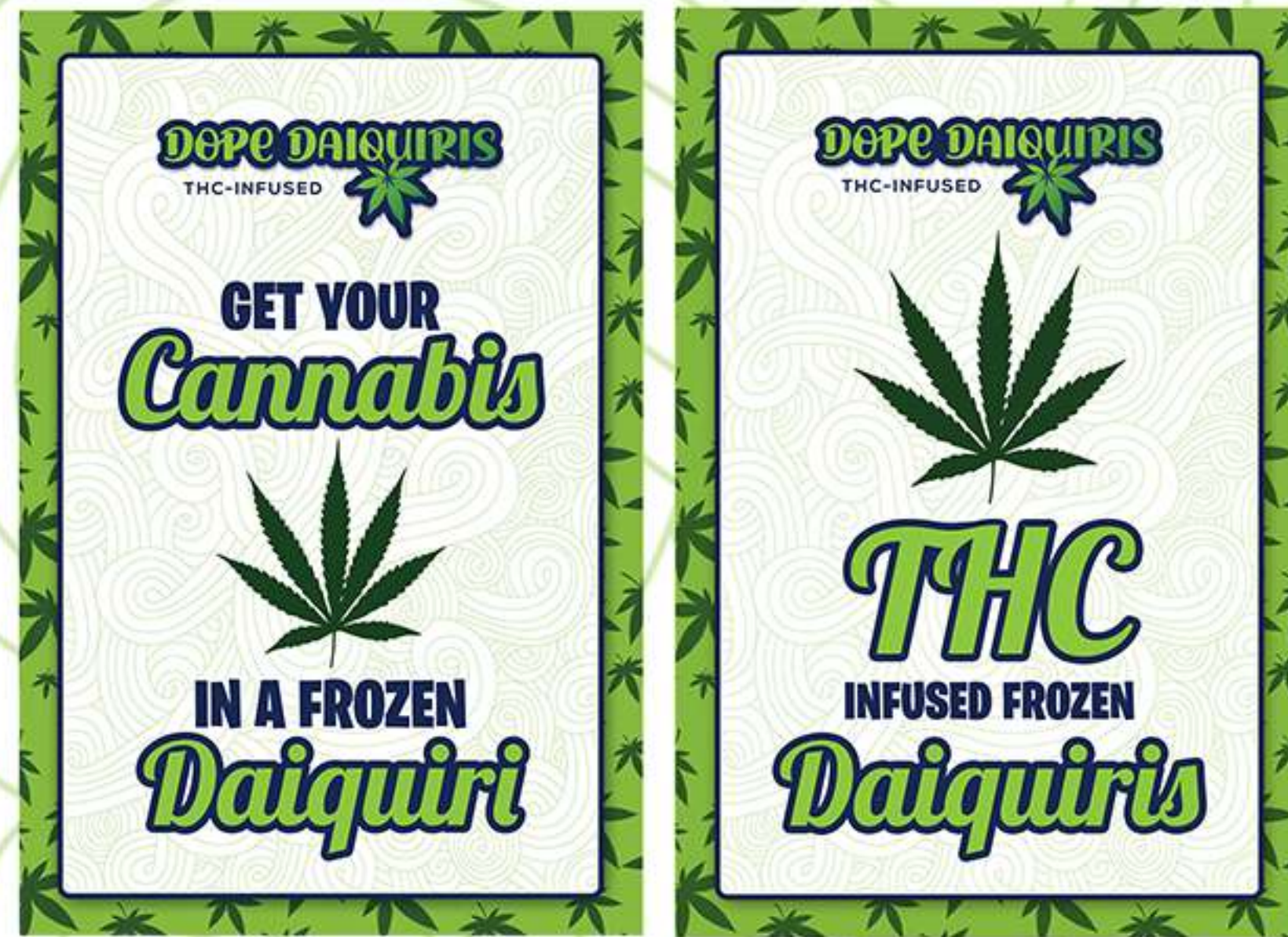
Sandwich Board Inserts