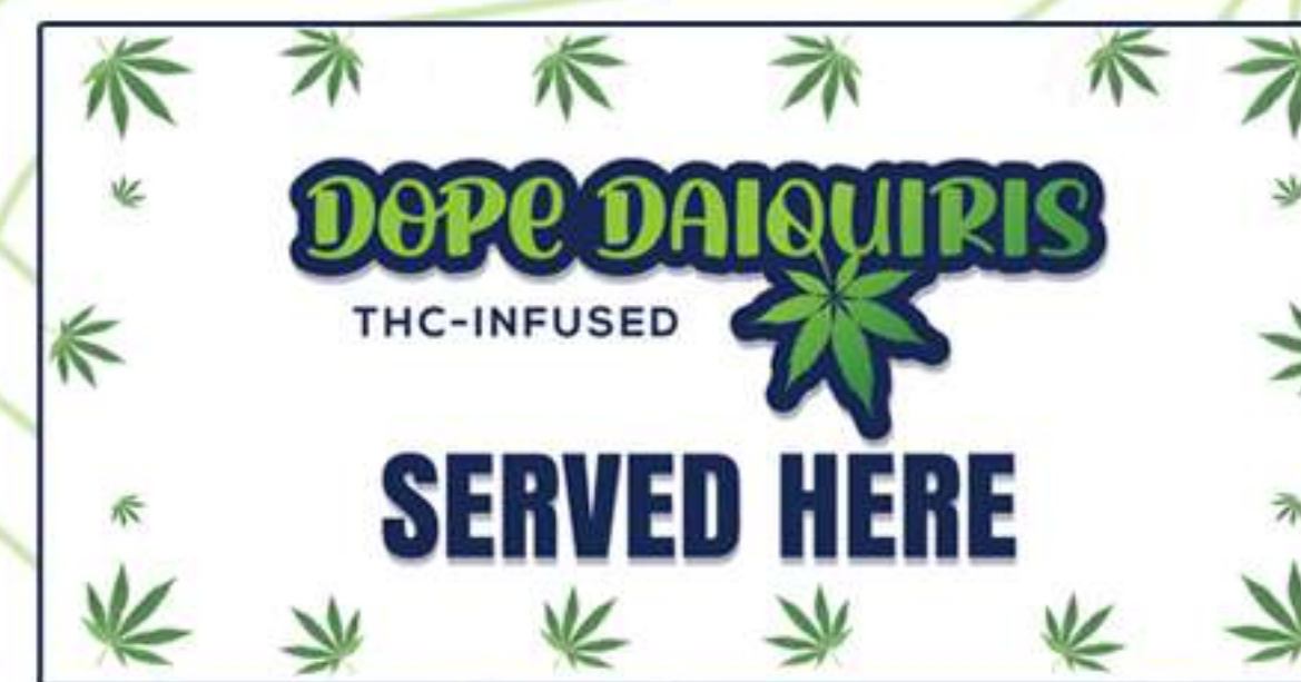
4x8 ft Banner